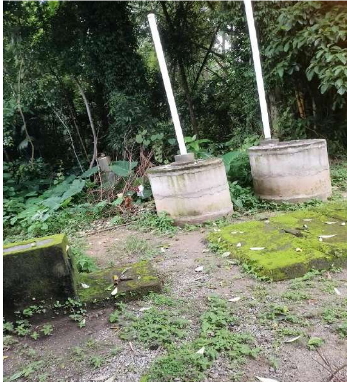
Figure 2 INCINERATOR IN HOSTEL

The ash generated from canteen were wood is used as a fuel is used as manoeuvre for plants. The college campus promoting biodegradable packaging and reducing the consumption of plastic to a large extent.