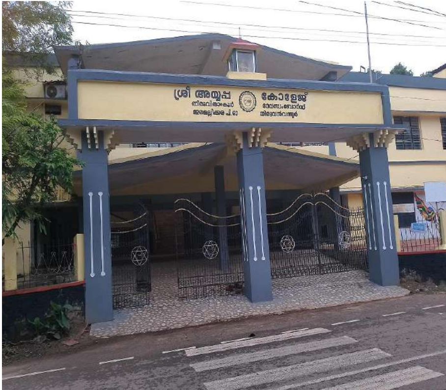
Figure 1 FRONT VIEW OF COLLEGE